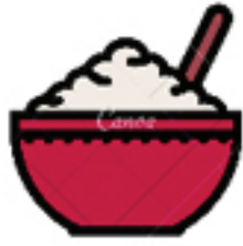
BOX WHITE CAKE MIX