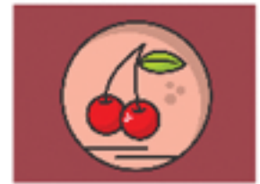
BOX CHERRY GELATIN